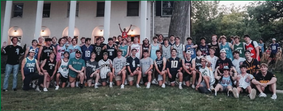
Fall Bid Day on September 15, 2022. We are happy to have these young men as Brothers and cannot wait to see what they do in the future.