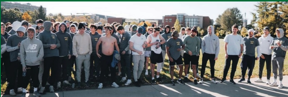
Brothers join Kappa Alpha Theta in the Run for the Young 5K in October.