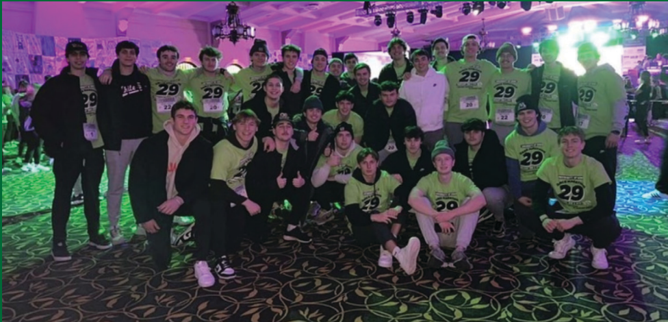
Brothers suit up for Dance Marathon at the Iowa Memorial Union.