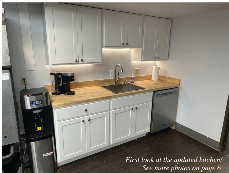
First look at the updated kitchen! See more photos on page 6.

Aligned with our maintenance and upkeep responsibilities, you’ll be pleased to hear we assisted the alumni House Corporation in updating the kitchen! We now have new cabinetry, countertops, appliances, and serving buffets. Such a renovation allowed us to contract a chef for the Chapter. The introduction of the house chef and new meal plan has provided Brothers with quality home-cooked meals to enjoy throughout the week, a luxury often limited to the sororities on campus. We feel