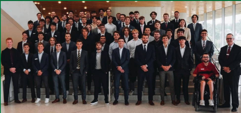
Brothers gather for the 26th annual Kinnick Scholarship Brunch. Scholarships were given to 14 worthy recipients, six of whom accepted a bid to our brotherhood.